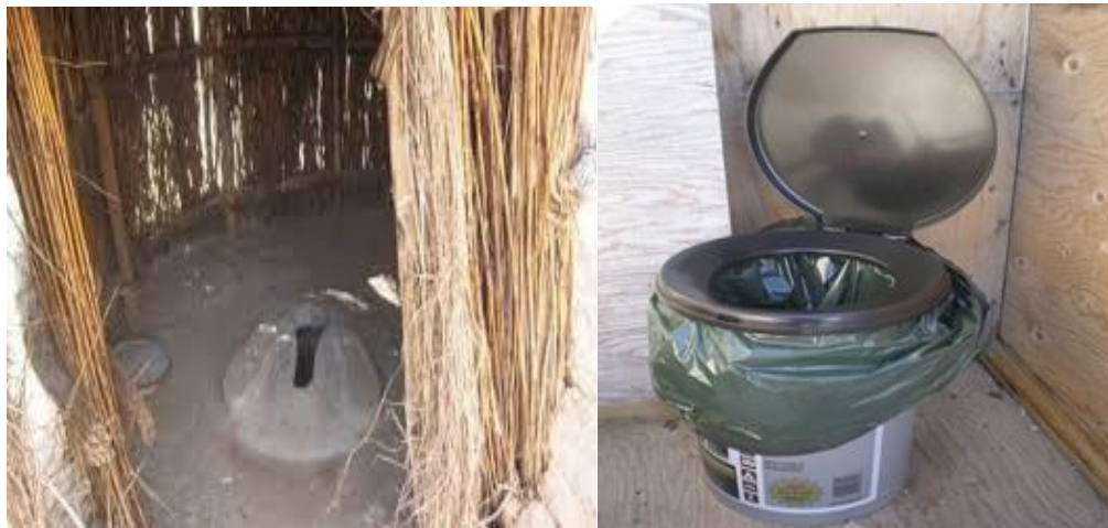
Figure 1. shows the pit latrine and bucket type in flood-prone areas of South-Western Nigeria.

diseases and infections in flood-prone areas. Thus, steps must be taken to encourage the use of a safe toilet system in the study area to forestall environmental and public health problems.